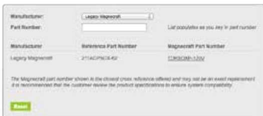
Cross Reference Tool