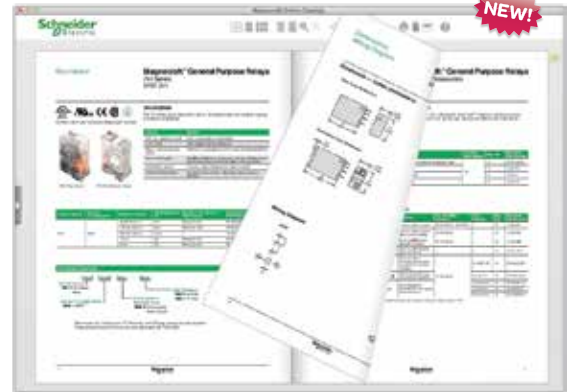
General Purpose Relay eCatalog