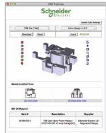
199 Power Relay 3D Model